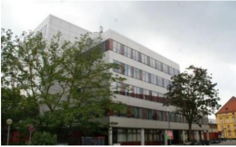
EW building (Building 15) Seminarstraße 20

The main administration building of the university. Yellow, attractive and located next to the palace gardens.