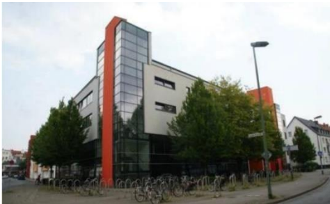
Kolping building (Building 01) Kolpingstraße 7

Student information Osnabrück: for questions about your student ID, BAföG or semester abroad.