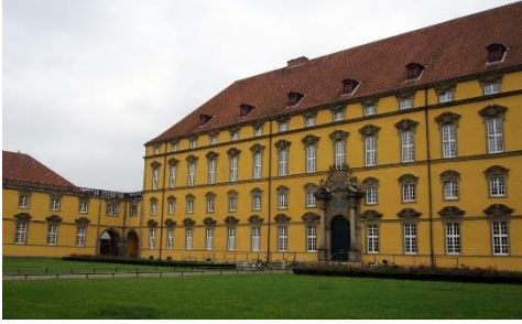
Castle (Building 11) Neuer Graben 29

The main administration building of the university. Yellow, attractive and located next to the palace gardens.