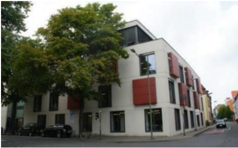
ELSI building (Building 44) Süsterstraße 28

This is where most of the language courses take place.