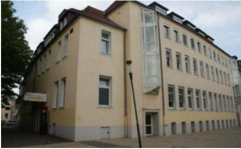
StudiOS (Building 19) Neuer Graben 27

Student information Osnabrück: for questions about your student ID, BAföG or semester abroad.