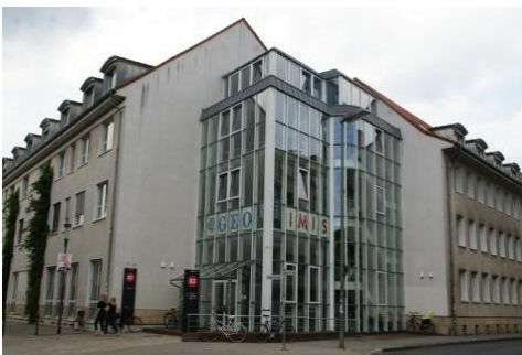
IMIS and Geo-Building (Building 02/03)