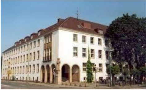
Old District Hall (Building 41) Neuer Graben 40

This is where most of the language courses take place.